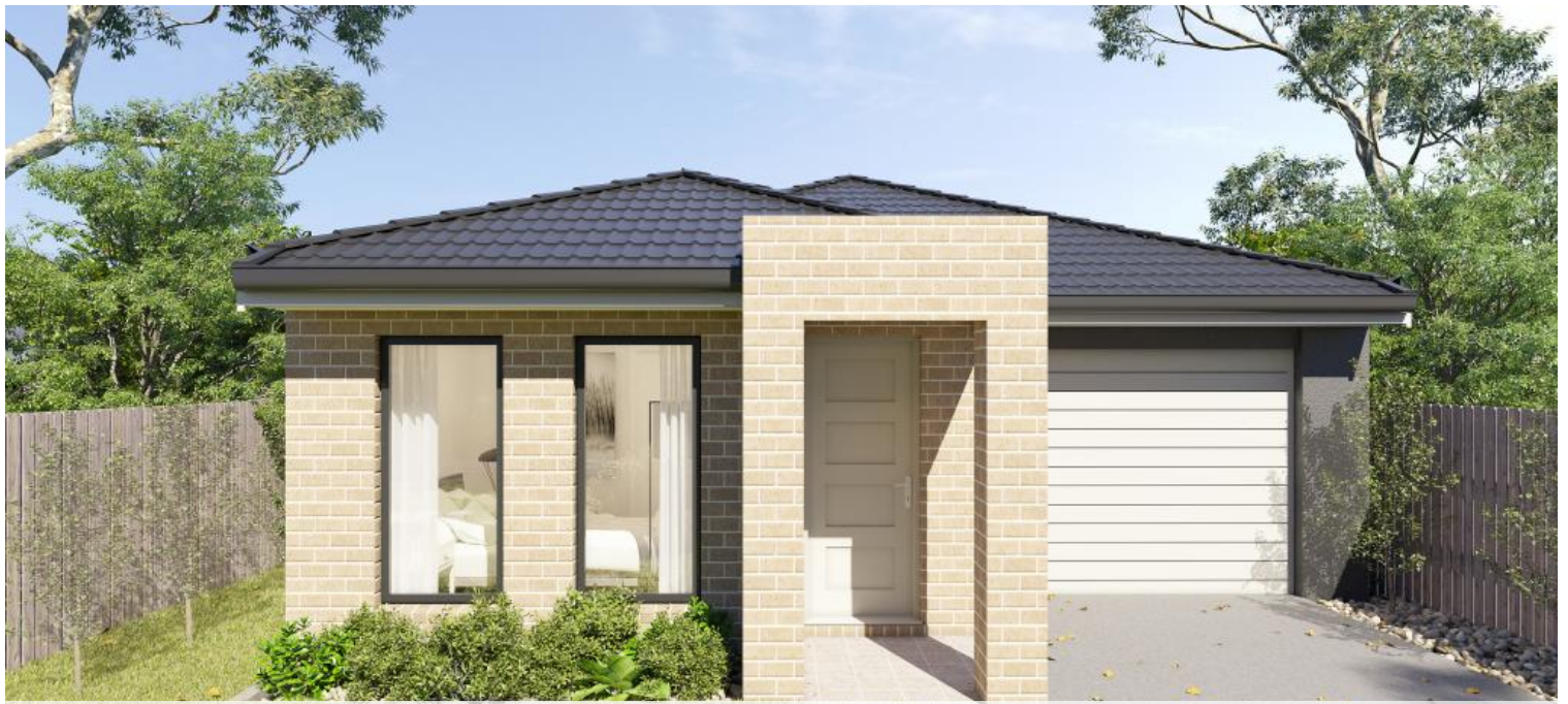
The Block Design 14.1 SQ, Cranbourne