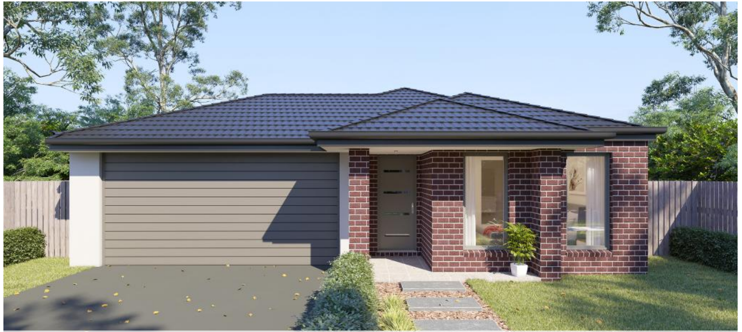
New Yorker Design, Cranbourne