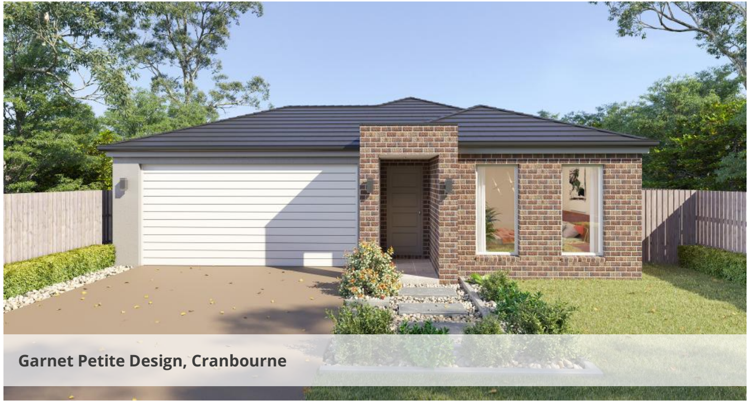
Garnet Petite Design, Cranbourne